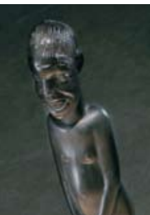
me me me detail

satirical form of expression. His output is a controlled amalgam of high art effiteness, quasi-autobiography, and low art travesty.