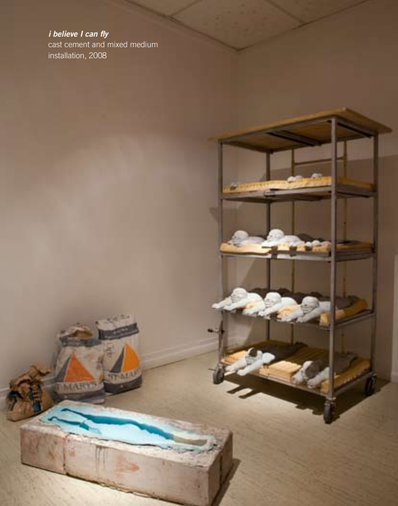
i believe I can fly cast cement and mixed medium installation, 2008