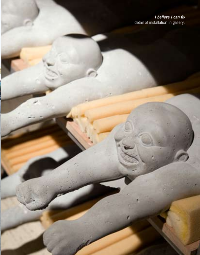
I believe I can fly detail of installation in gallery.