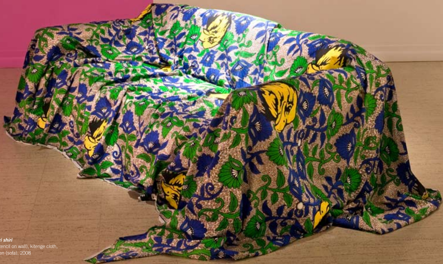
dai ndiri shiri paint (stencil on wall), kitenge cloth, silkscreen (sofa), 2008