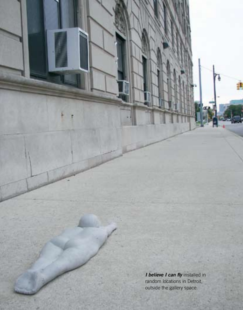
I believe I can fly installed in random locations in Detroit, outside the gallery space.