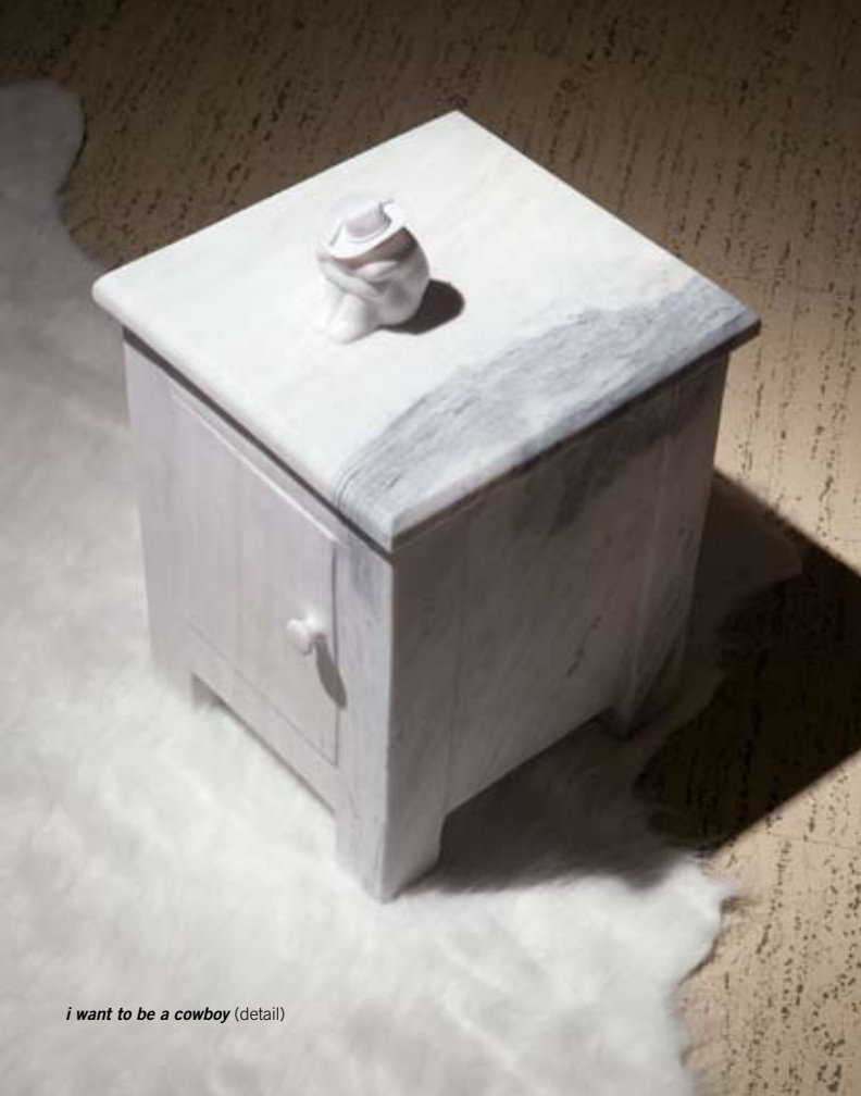
i want to be a cowboy (detail)