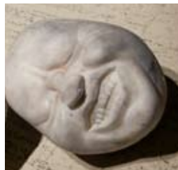
playball cast foam, gymn ball net, hook, sound, dirt, 2008